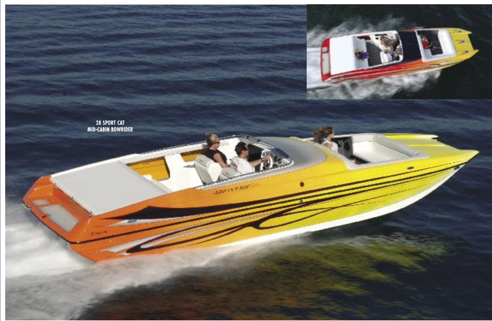
28 SPORT CAT MID-CABIN BOWRIDER