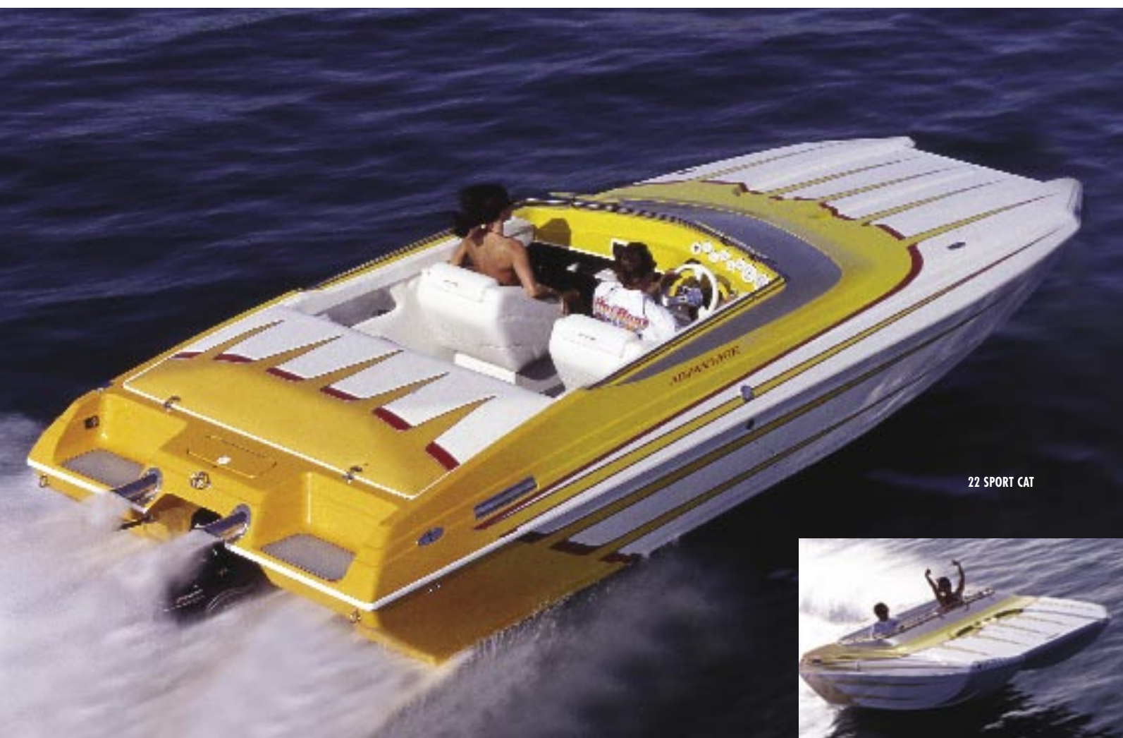
22 SPORT CAT